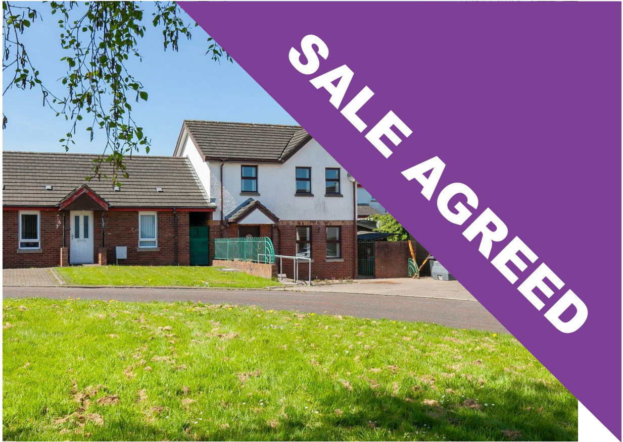
45 Abbeyville Street, Newtownabbey, BT37 0AG